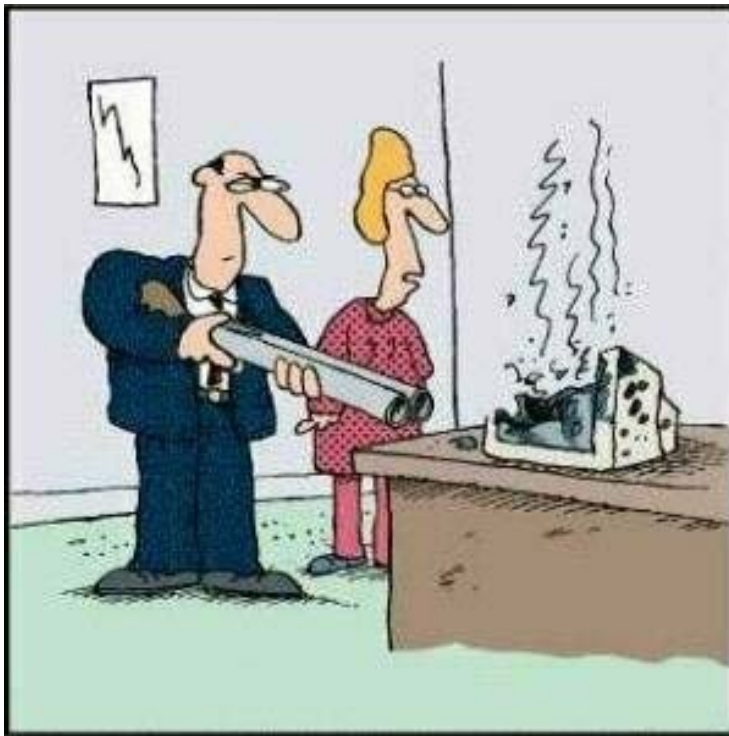
"There are better ways to log off."

He said, "I'm awfully sorry for this mistake. You see, as I pulled up behind your car while you were blowing your horn, flipping the guy off in front of you, and cussing a blue streak at him, that I noticed the "What Would Jesus Do" license plate holder, the "Follow me to Sunday School" bumper sticker, the chrome plated Christian fish emblem on the trunk and the "My Boss is a Jewish Carpenter" decal on your back window ..... Naturally, I assumed you were in a stolen car".