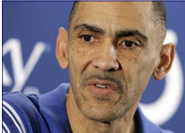
Tony Dungy, Head Coach, Indianapolis Colts