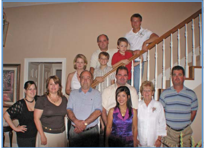
The Love Family

There were also those young days in First